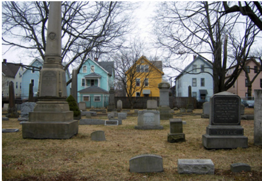
UNION CEMETERY IN FAIR HAVEN. AN OLD GRAVEYARD WITH NEW TRASH. THE HOUSES AROUND THE GRAVEYARD WERE ALL PAINTED BRIGHT PASTEL COLORS.